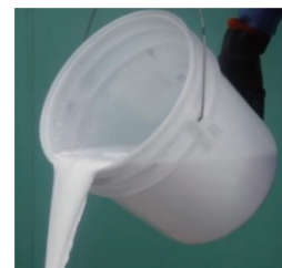
Fig. 4 Appearance of Activator F2