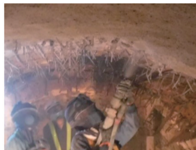
Fig. 1 Wet gunning to ceiling application with Activator F2