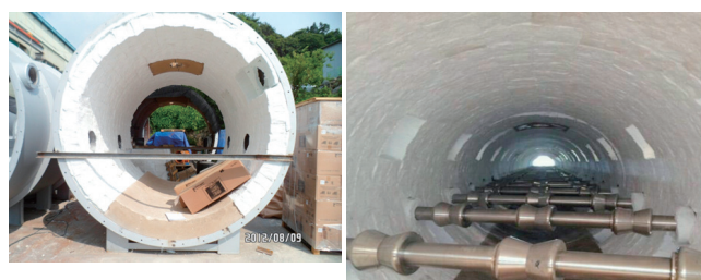
Fig. 4 Installation in heat treatment furnace -2