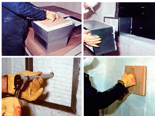
Fig. 2 M Module installation (Step 2-5)