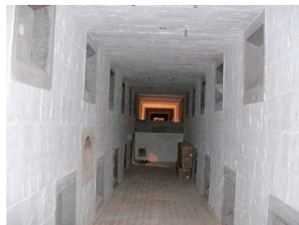
Fig. 3 Installation in heat treatment furnace -1