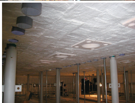
Fig. 5 Installation in reformer

* These case studies include RCF grade Pyro-Bloc® installation.