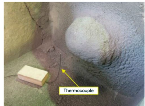
Fig. 3 Result of rapid heating experiment.